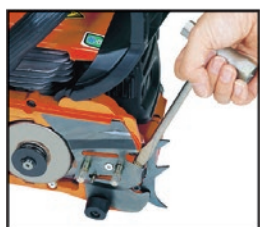
Unique chain tensioner

ECHO's CS-390ESX is built for the professional user and has a powerful new 38.4cc engine. With a lightweight and durable magnesium body, this chainsaw has an excellent power-to-weight ratio and a dry weight of 4.5kg.