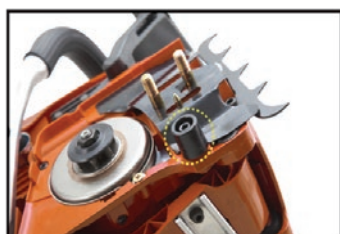
Rotating chain catcher