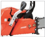
Double Spike (Standard)