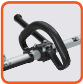
AVAILABLE WITH 'U' OR LOOP HANDLE