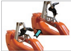
Quick hook-up and release harness