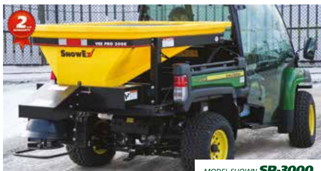
MODEL SHOWN SP-3000