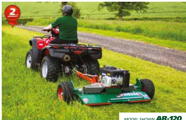
MODEL SHOWN AR-120