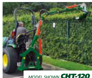
MODEL SHOWN CHT-120