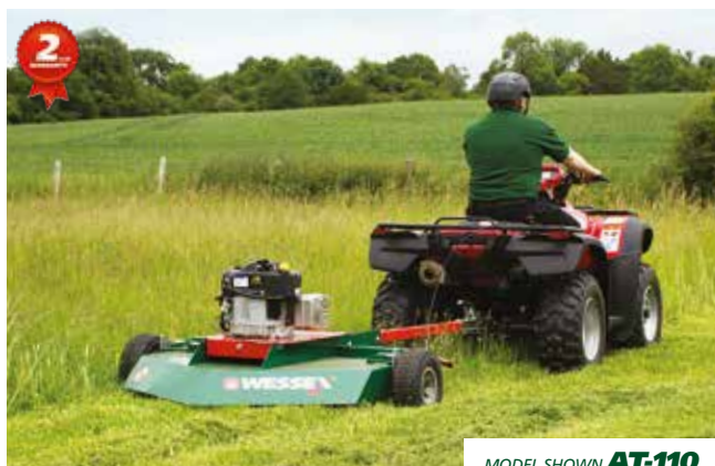
MODEL SHOWN AT-110