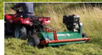
INSET IMAGE AFE-120