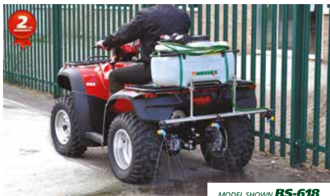
MODEL SHOWN BS-618