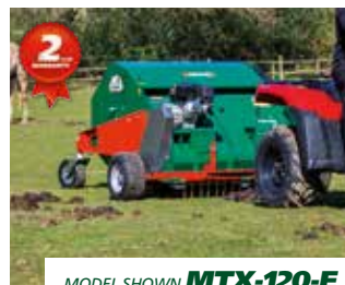
MODEL SHOWN MTX-120-E