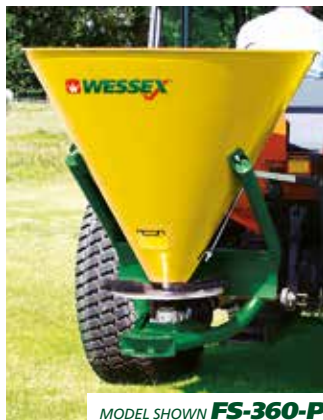
MODEL SHOWN FS-360-P