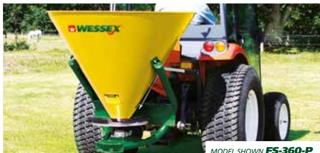
MODEL SHOWN FS-360-P