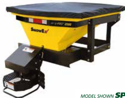
MODEL SHOWN SP-2000