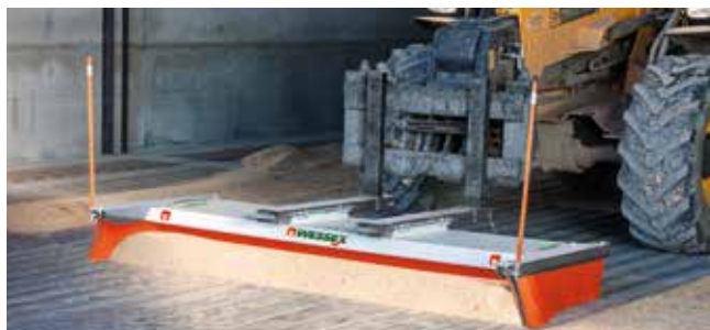
MODEL SHOWN BM-240-CMAX C/W FSH-400 FORK HITCH