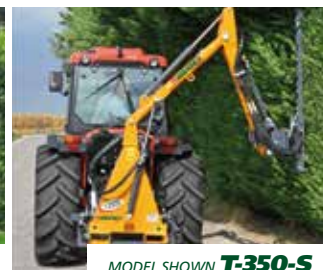
MODEL SHOWN T-350-S