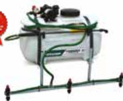
MODEL SHOWN SS-608P