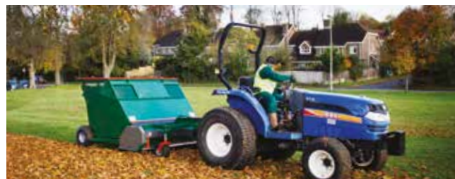
MODEL SHOWN STC-180