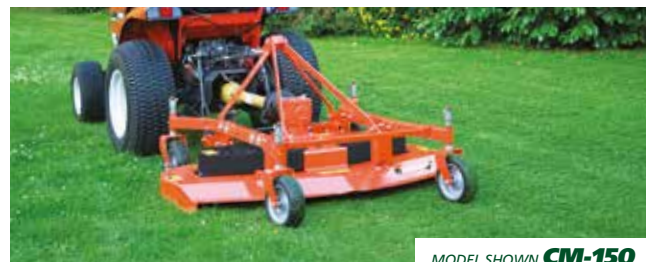
MODEL SHOWN CM-150