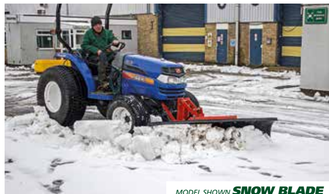
MODEL SHOWN SNOW BLADE