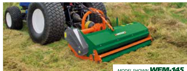
MODEL SHOWN WFM-145