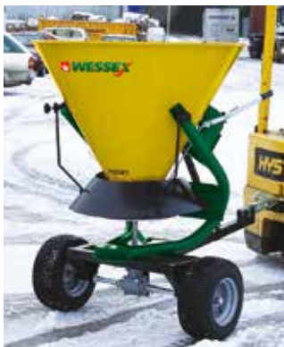
MODEL SHOWN FS-270-TP-WK