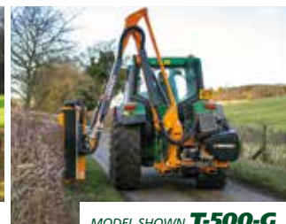
MODEL SHOWN T-500-G