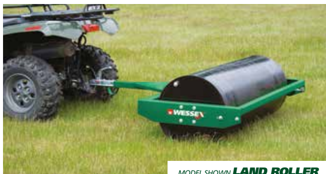
MODEL SHOWN LAND ROLLER