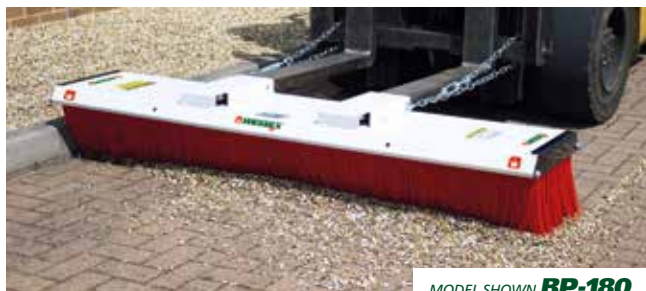
MODEL SHOWN BP-180