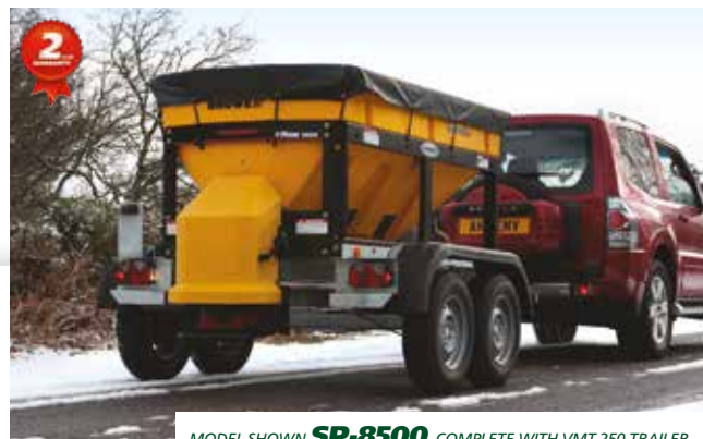
MODEL SHOWN SP-8500 COMPLETE WITH VMT-250 TRAILER