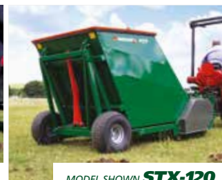
MODEL SHOWN STX-120