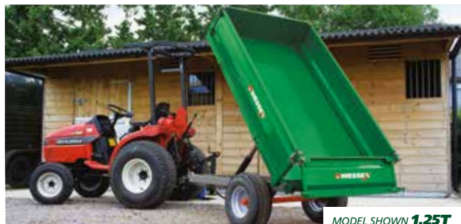
MODEL SHOWN 1.25T