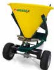
MODEL SHOWN FS-270-TP

For salt spreaders, see the Winterline product range on page 19.