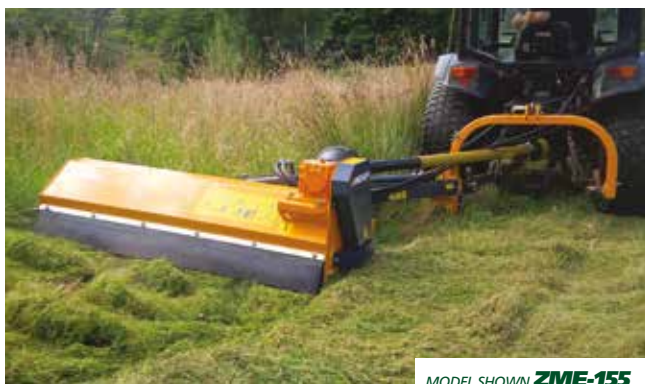
MODEL SHOWN ZME-155