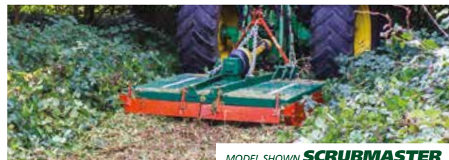
MODEL SHOWN SCRUBMASTER