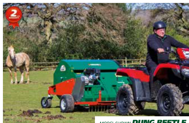
MODEL SHOWN DUNG BEETLE