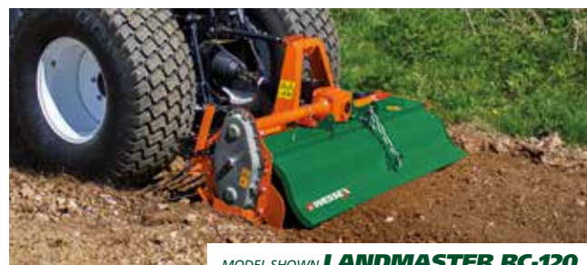
MODEL SHOWN LANDMASTER RC-120