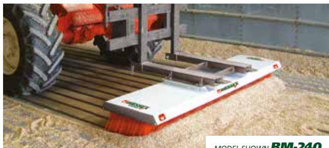
MODEL SHOWN BM-240