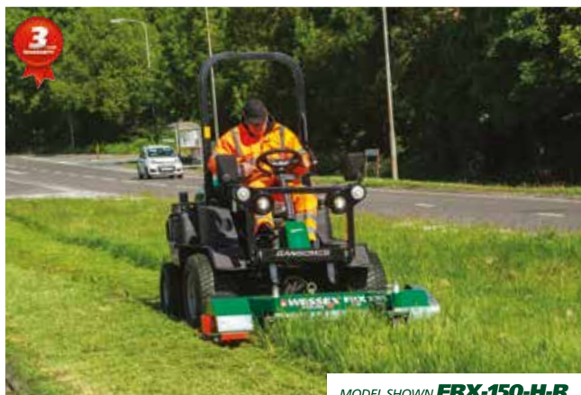
MODEL SHOWN FRX-150-H-R