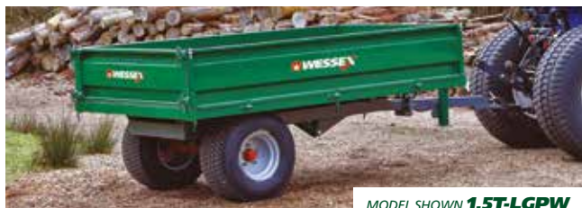
MODEL SHOWN 1.5T-LGPW