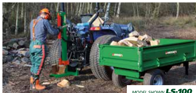
MODEL SHOWN LS-100