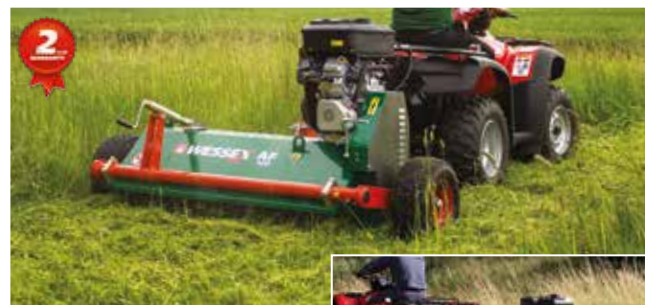
(ABOVE) MODEL SHOWN AF-120