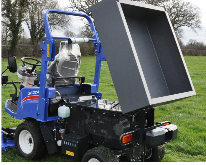
Tipping storage box for easy service access.